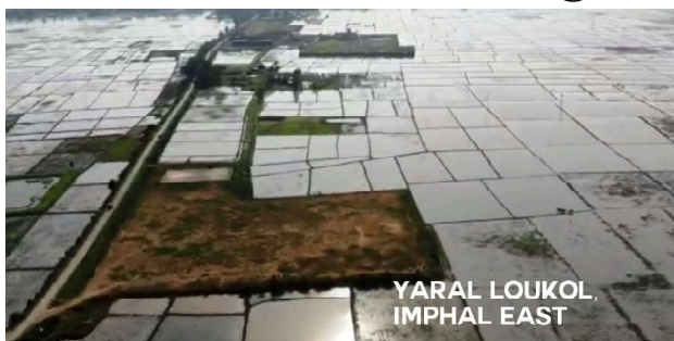
YARAL LOUKOL, IMPHAL EAST

According to an organization of farmers called 'The Protection Committee of Yaro to Gurupat Loukol Top, Kshtri, Imphal East District, paddy cultivable fields of around 35.5 hectares, located in between Yaro to Naharup area have been flooded with water due to error committed by government department. Farmers are left with no means but to watch