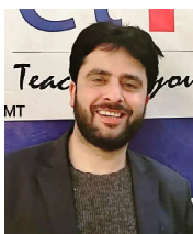
By: Aubaid Akhoun

"The world will not be destroyed by those who do devil, but by those who watch them without doing anything"